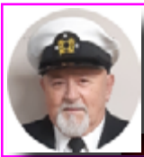
Immediate Past Commodore

Reports - click on picture to go to report