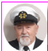
Immediate Past Commodore

Reports - click on picture to go to report