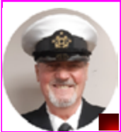
Immediate Past Commodore

Reports - click on picture to go to report