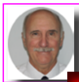
Asst. Fleet Captain