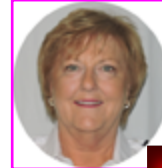
Communications & Secretary