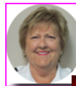
Communications & Secretary