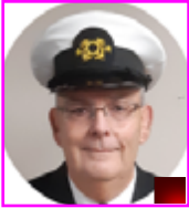
Immediate Past Commodore

Reports - click on picture to go to report