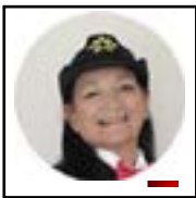
Immediate Past Commodore