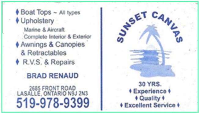
This vendor is authorized to work at Holiday Harbour

Please support our Advertisers as they support US.