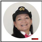
Immediate Past Commodore