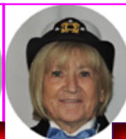
& Immediate Past Commodore