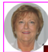
Communications & Secretary