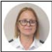
Immediate Past Commodore