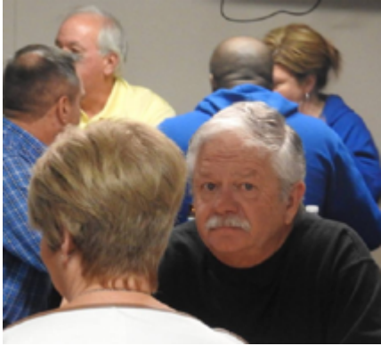
The cat that ate the canary

So ... I was going through some pics to try to fill up an area on this page and I had an idea. How about a caption page? If you can think of a caption to apply to any of these pictures or any pics that you might have taken, send them to me ( spbcommunications@bell.net ) and I will forward them to our members, just for a few laughs.