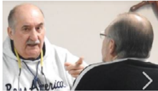
You know what he called me after that?