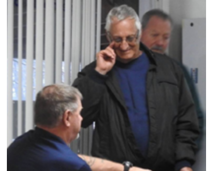
Yep, I spotted it with this eye, right here.