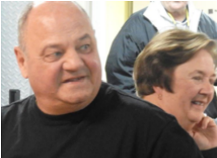
Ok, who's the bugger that cut the cheese?