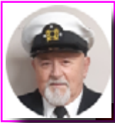
Immediate Past Commodore