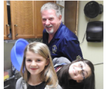
The definition of what's called a happygrams.