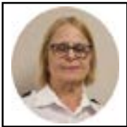
Immediate Past Commodore