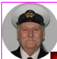
Commodore & Immediate Past Commodore