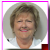
Communications & Secretary