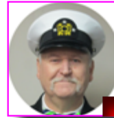
Immediate Past Commodore