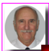
Asst. Fleet Captain