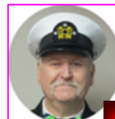
Immediate Past Commodore